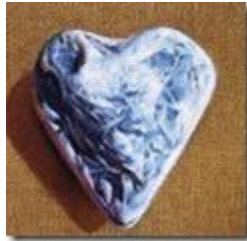
Pharaoh's Heart of Stone

"Blessed are those whose way of life is blameless; who live by the Torah of Adonai. Blessed are those who observe His instruction; who seek Him with all their heart." Psalm 119