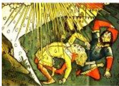
Death of Nadab & Abihu

kach-lecha egel ben-bakar lechatat v'ayil l'olah tmimim v'hakrev lifney Adonai "Take yourself a calf for a sin offering and a ram for a burnt offering, [both] unblemished, and offer them before God."