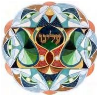
Aleinu - It is our Duty

is what defiles the man. For from within, out of the hearts of men, proceed the evil thoughts, fornications, thefts, murders, adulteries, deeds of coveting and wickedness, as well as deceit, sensuality, envy, slander, pride and foolishness. All these evil things proceed from within and defile the man"