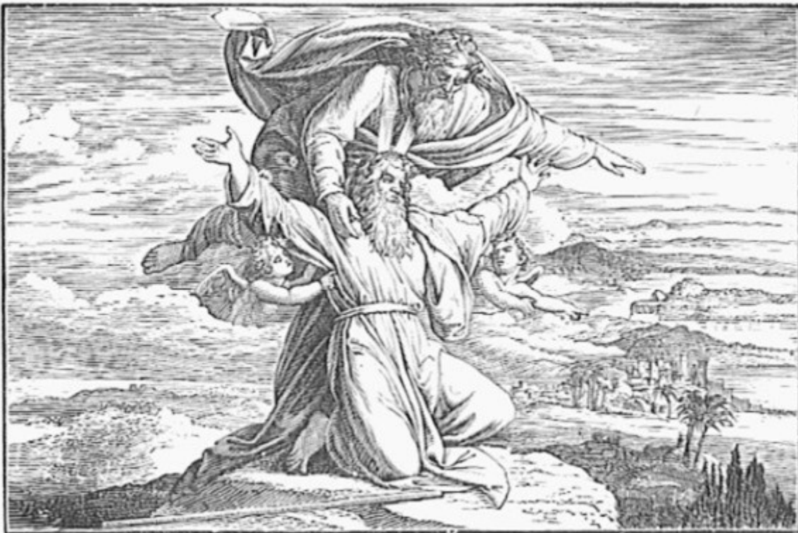
MOSES VIEWING THE PROMISED LAND.—Deut. 34 : 4.

Moses' last words of blessing were words that any father would wish for his children, as they follow the God of Israel: "Blessed are you, O Israel. Who is like you, a people saved by the Lord, who is the shield of your help and the sword of your majesty! So your enemies shall cringe before you, and you shall tread upon their high places." The legacy of Moses to "his children" was to follow the God of Israel and trust in Him alone for their physical and spiritual salvation. May this also be our legacy to all "our children!"